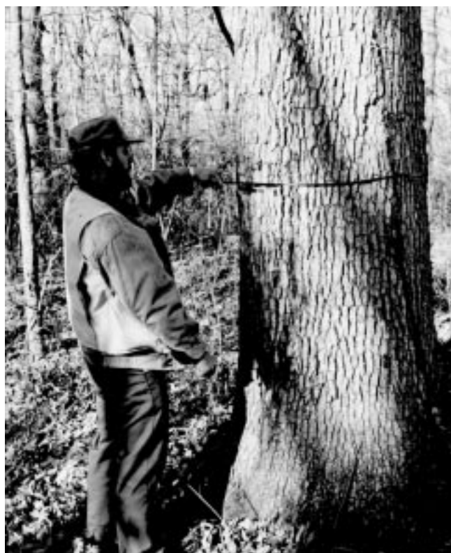
Figure 1. Forester measuring the diameter of a white oak tree using a diameter tape held at breast height, or 4 1/2 feet from the ground (Photo by R. Griffiths).

Buyers of timber will always need to conduct a survey of your woods before they can make an offer. This survey is often called a timber cruise and involves a series of measurements of individual trees, as well as an assessment of factors that will influence the price of your timber. Such factors include the terrain, the amount of