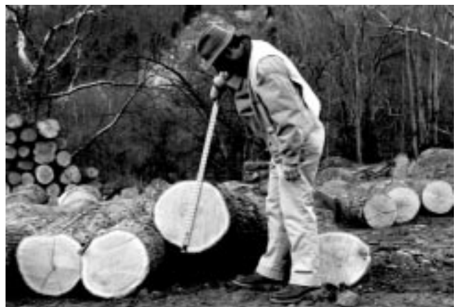
Figure 3. Forester scaling hardwood logs.

The measurement of the wood volume contained in sawlogs is commonly known as log scaling (Figure 3). A log of a certain length and diameter (always measured at the smallest end of the log) will contain a certain number of board feet. Just how many board feet a log contains depends upon the log rule used by the scaler. Since logs often contain defects that reduce the merchantable wood volume, scalers will often apply deductions to remove the estimated useless volume in a log from the total.